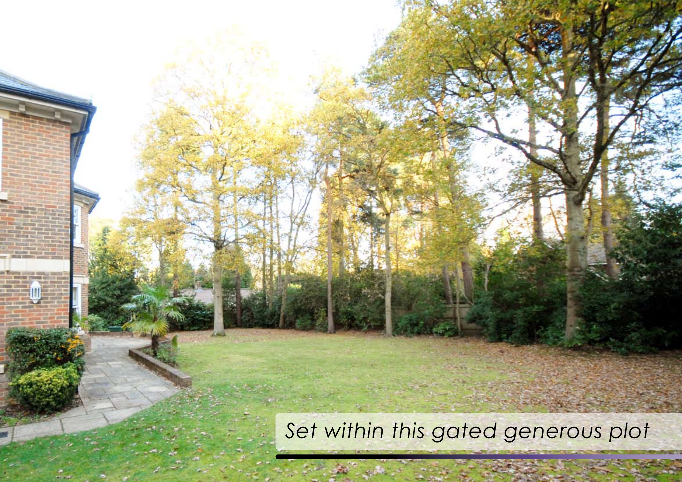
Set within this gated generous plot